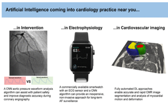
Fig. 1. Role of Artificial Intelligence in Cardiology [45].

patients that may include medical records, laboratory outcomes, and likewise. Another form of operational database is the administrative operational database that mainly include business information essential for administrative management. This usually pertains to financial details, details of the employees, and likewise. External operational database is the third type of database included by the external provider, concerning insurance forms, medical forms and medical reports [11].